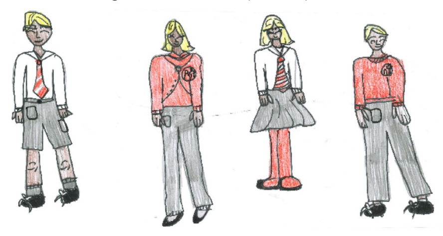
Please label all items with your child's name.

School does have some pre loved uniform available for any families who require it. Please contact the school office, to see what items we currently have available.